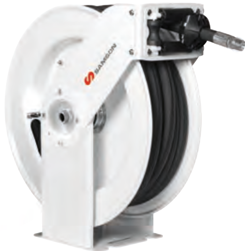
Roller arm in tank/wall mount position